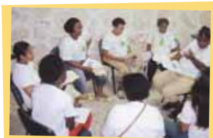
Evaluation and Feedback Meeting in the Dominican Republic

During the meeting, the Leaders assess the progresses of their actions, using the methodology of See, Assess, Act, Evaluate and Celebrate. In this meeting, they observe the reality of the families that follow evaluate the causes and consequences of a certain situation, gather efforts and evaluate which alternatives can help the family or the community.