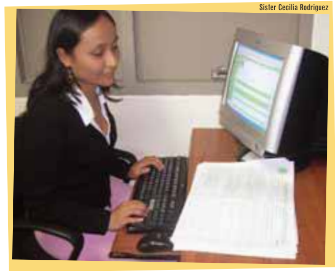
Typing of Monthly Follow-up and Assessment Sheet sent by communities in Colombia

A big information network, that gathers and co-ordinates all the data of the Child's Pastoral of Brazil, is responsible for evaluating all the actions, contributing to define the objectives and motivate the volunteers. Every month the community leaders collect information about the followed children during the Home Visit and the Life Celebration Day. In the Monthly Evaluation and Feedback Meeting, they fill in these data in the FABS (Monthly Follow-up and Assessment Sheet of the Health and Education Basic Actions), which is sent to the National Coordination Office of the Child's Pastoral. There the information about each child is typed, systematized and returned to the communities under the form of a Quarterly Report, congratulating for the achievements, warning for risks and instructing on how to improve any actions that have not given good results.