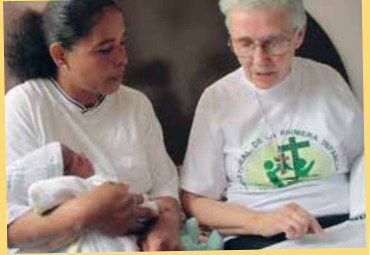
Home visit by a communitarian leader in Colombia

Each Leader in Brazil follows an average of 13 children