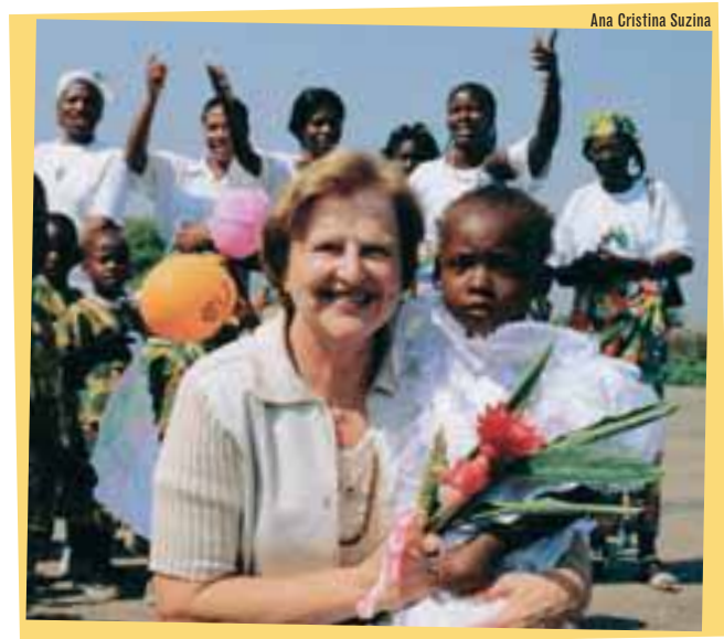
Dr. Zilda Arns Neumann visit to Angola in 2002

The National Conference of Bishops of Brazil (CNBB) approved the proposal and appointed the Archbishop of Londrina at that time, Dom Geraldo Majella Agnelo, currently the Cardinal Primaz of São Salvador da Bahia, to follow the development of the work. The slogan chosen was “I have come so that they may have life and have it to the full.” John 10:10.. The pilot-project was implemented in Florestópolis, municipality belonging to the Archdiocese of Londrina, in the north of the state of Paraná, which had a high mortality rate, 127 death per one thousand children born alive.