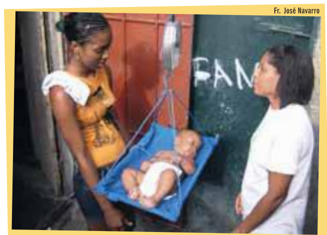
Communitarian Leader weighs a child in the Dominican Republic

In 43.000 communities children are weighed every month and the malnourished are treated and cared for.