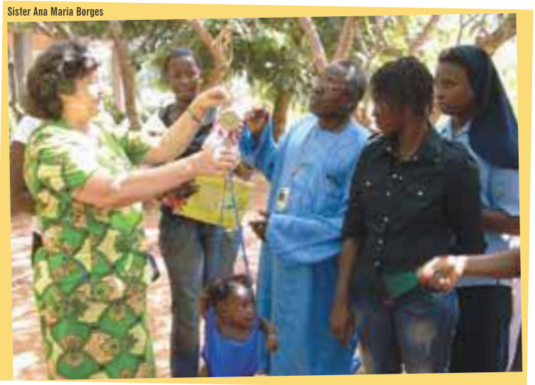
Ecumenical Group in Guinea-Bissau