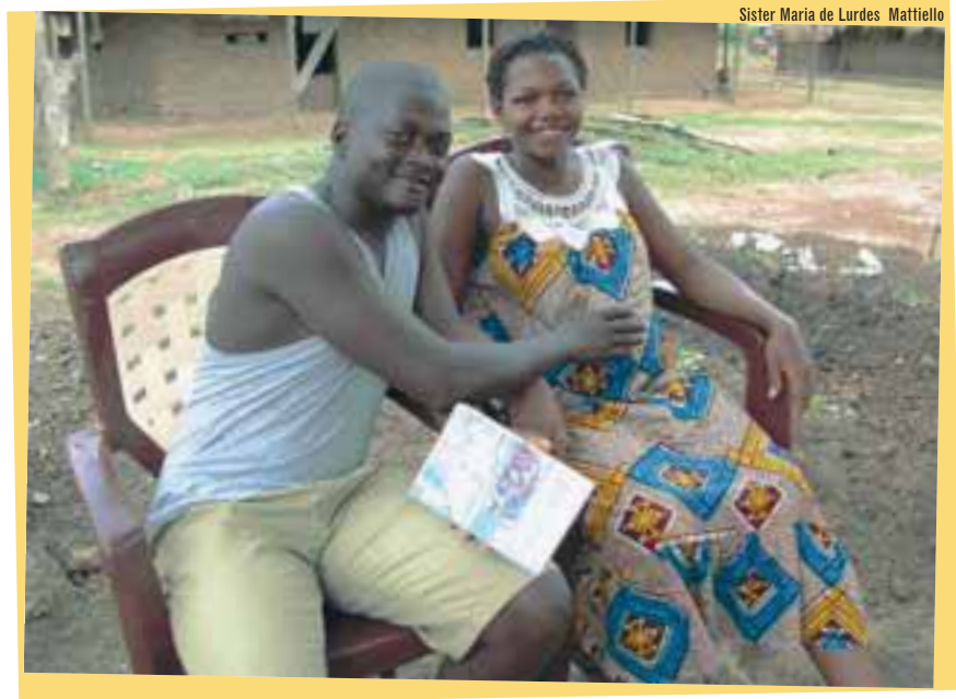
Guinean man with his pregnant wife