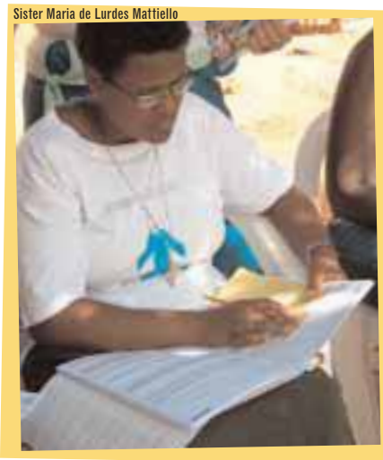
Communitarian Leader in Guinea-Bissau with the Leader's Notebook

The Measuring Spoon indicates the quantities of salt and sugar that have to be added to a glass of 200 millilitres (ml) of clean water. The preparation of oral rehydration, according to the leaflet, mentions two measures of sugar and one of salt. Thus, in a simple and inexpensive way, the leader instruct the mothers on how to avoid dehydration caused by diarrhea.